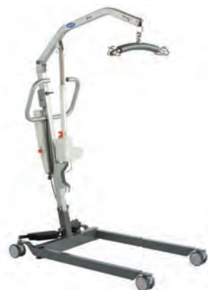
Shown with electric leg spread

Advanced features for an improved transfer environment. The Invacare® Birdie™ is a larger, higher lifting capacity version of the Birdie Compact and is a workhorse in many care establishments being simple to fold, unfold and dismantle without tools. Invacare Birdie hoists take up minimal space when stored and are easy to push and transport.